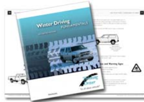
Winter Driving Manual Great addition to the DVD $12.95