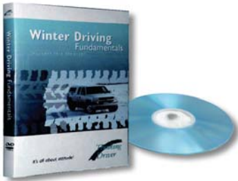
Winter Driving DVD Includes skid recovery $229