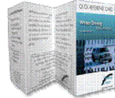
Winter Driving Quick Reference Cards Excellent Handout after viewing DVD or reading the manual $2.49